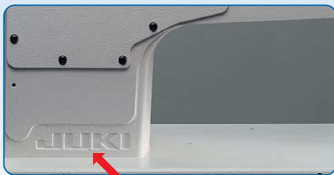
Embossed JUKI mark